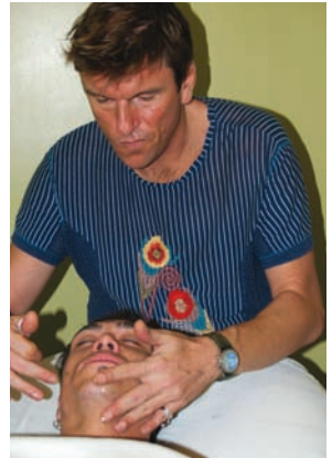
From left to right: Steel Gym, PumpOne and Body Beautiful Spa. Facing page: face to face nyc day spa